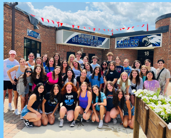
2023-2024 Eisenhower Student Council!