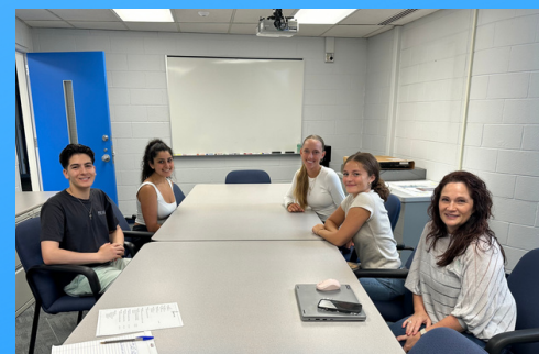
2023-2024 National Honor Society Leadership Team!!